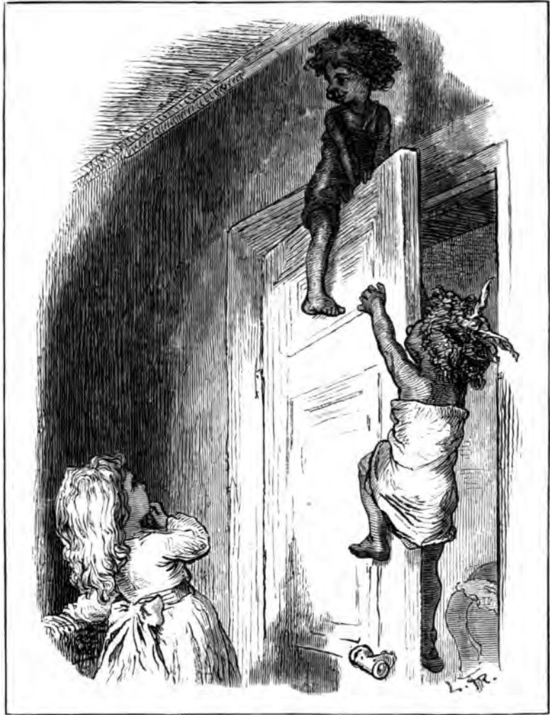
Lavo had climbed up the side of the door, and was sitting astride on the top of it.